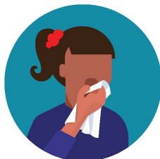
Cover your coughs and sneezes