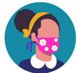
Wear a mask