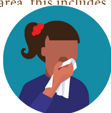
Cover your coughs and sneezes