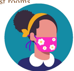
Wear a mask