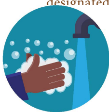
Wash your hands often