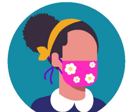
Wear a mask