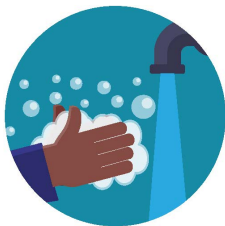
Wash your hands often